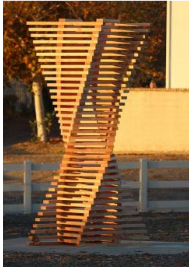
Basics #56 – Santa Clarita, CA